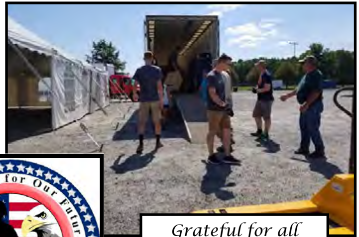
Grateful for all our volunteers!