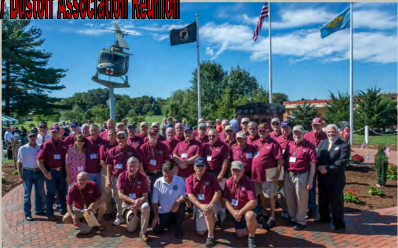
Dustoff Units in Vietnam - 'So Others May Live'

The radio call sign "Dustoff" originated as the call sign for the helicopter units dedicated exclusively to evacuating wounded from the battlefield. By 1966, there were several Dustoff units in various locations in Vietnam. A Dustoff mission was three times more dangerous than any other helicopter mission. During eleven years of conflict, 211 crewmen died. If asked to pull back under fire, Dustoffers response was "when we have your wounded." From 1962 to 1973, a total of 496, 573 missions were flown carrying over 900, 000 patients. The average time to transport a wounded patient to a hospital was less than one hour. Less than 1% of American wounded who survived the first 24 hours died.