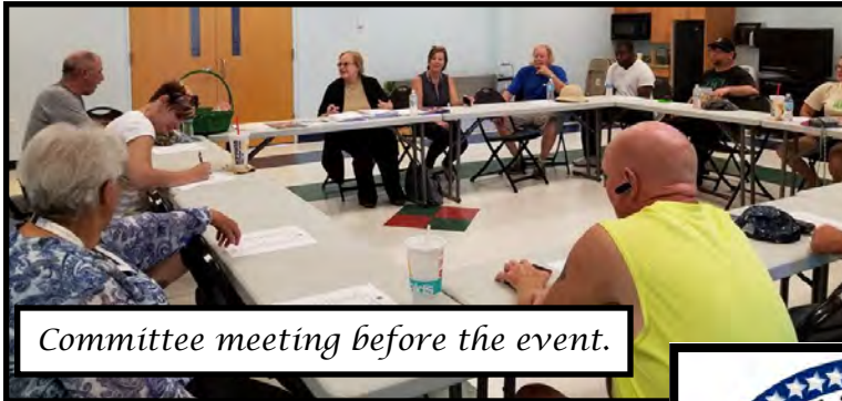
Committee meeting before the event.